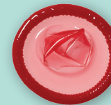
Condoms, for men or women